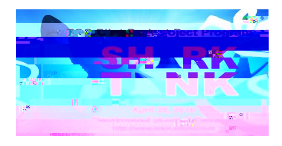
TCC Shark Tank FrequentlyAskedQuestions (FAQ)